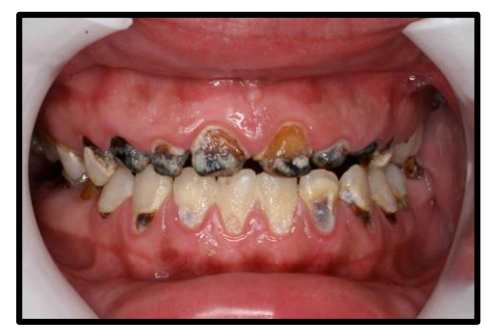
Fig. 2: Radiation Caries