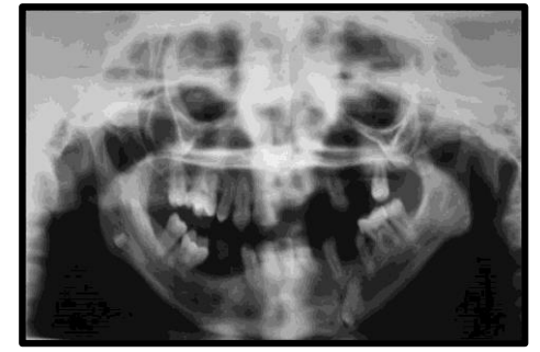
Fig. 3: Hypodontia, microdontia inverted & impacted premolars & stunted permanent teeth root