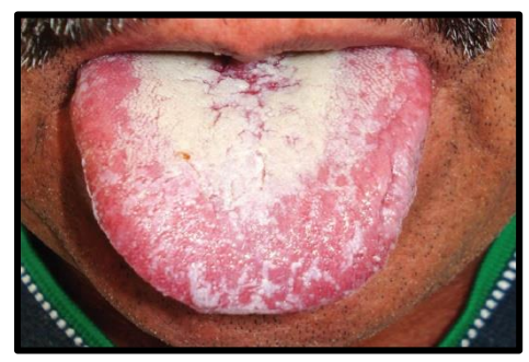
Fig. 1: Pseudomembranous Candidiasis